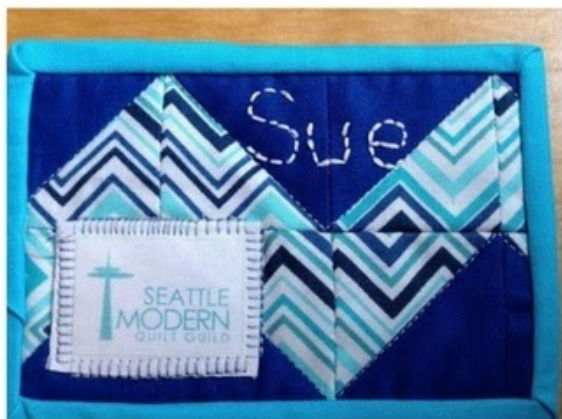
Sue Sew Crafty