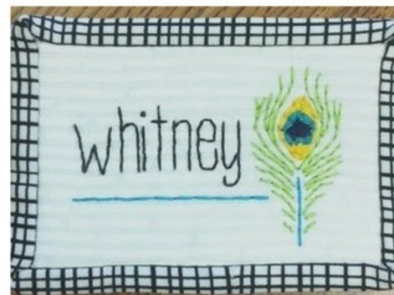
whitney (the peacock tree)