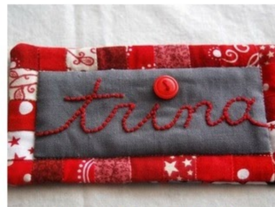
trinsadoings on Flickr