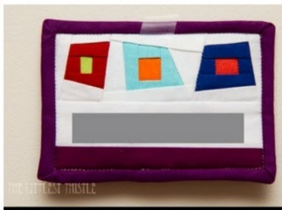
The Littlest Thistle