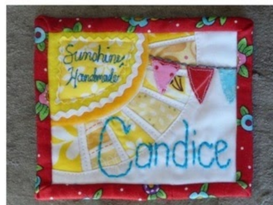
Lightning Bugz on Flickr