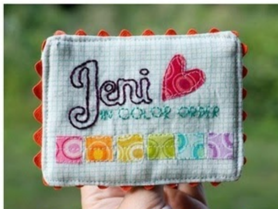
Jeni Baker In Color Order