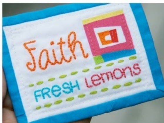
Faith Fresh Lemons