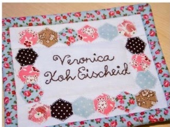
VeronicaMade on Flickr